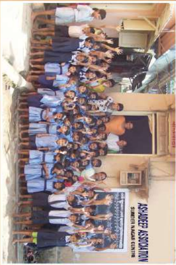
SUNDER NAGAR CENTRE