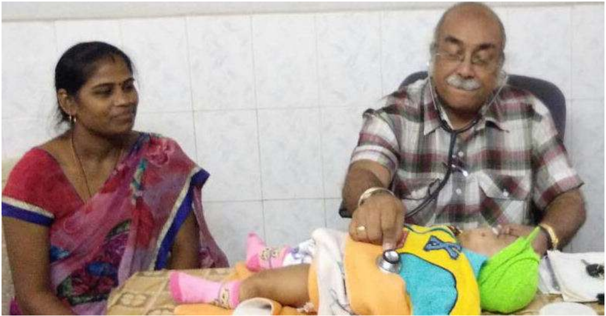
Staff of Ashadeep Association, Dindoshi Centre

I am very happy, that the sick patients feel it is a great relief when they are treated in this dispensary.