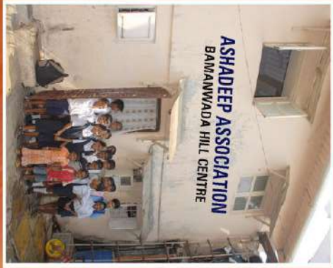
BAMANWADA HILL CENTRE